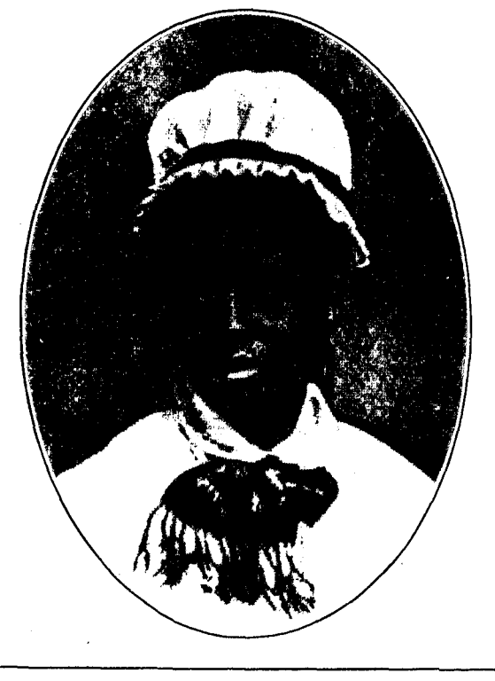
The First Professional Colored Nurse.

* Faber & Faber, Ltd., 24, Russell Square, London. Price 6/-.